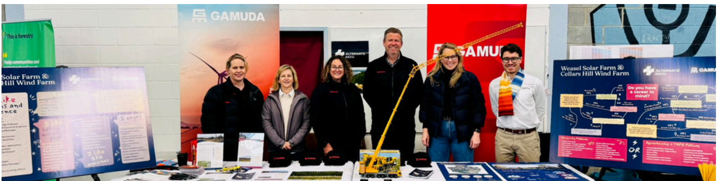
Image: Gamuda generously donated a scale model mobile crane to Bothwell District High School at the 2025 Careers Expo and presented a second model as a prize to the student who asked the best question.